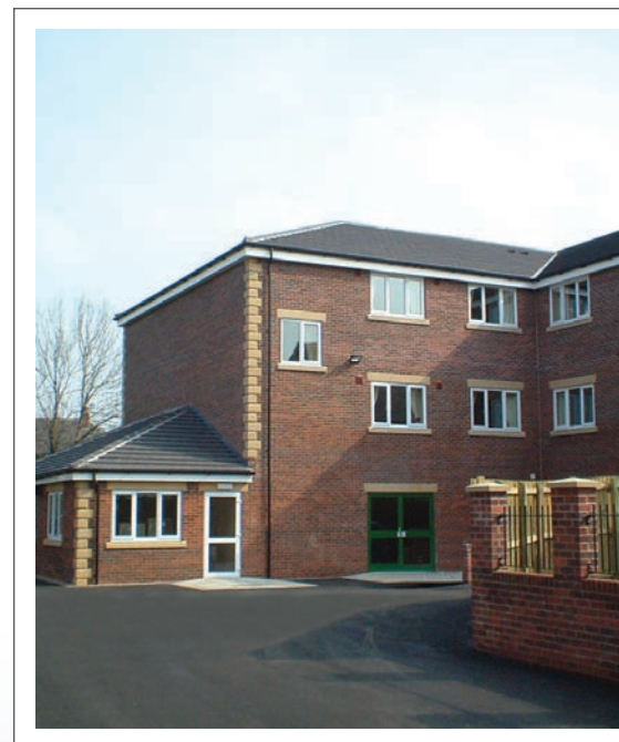
Entrance & Courtyard