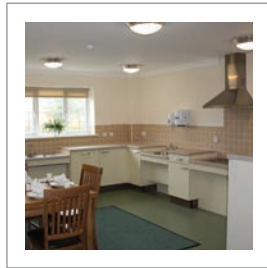
Disabled Access Kitchen