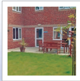
Lawn & Patio Area