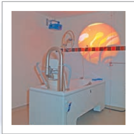
Sensory Bathing Area

This secure unit included extra sensory en-suite wet rooms throughout and a secure garden area.